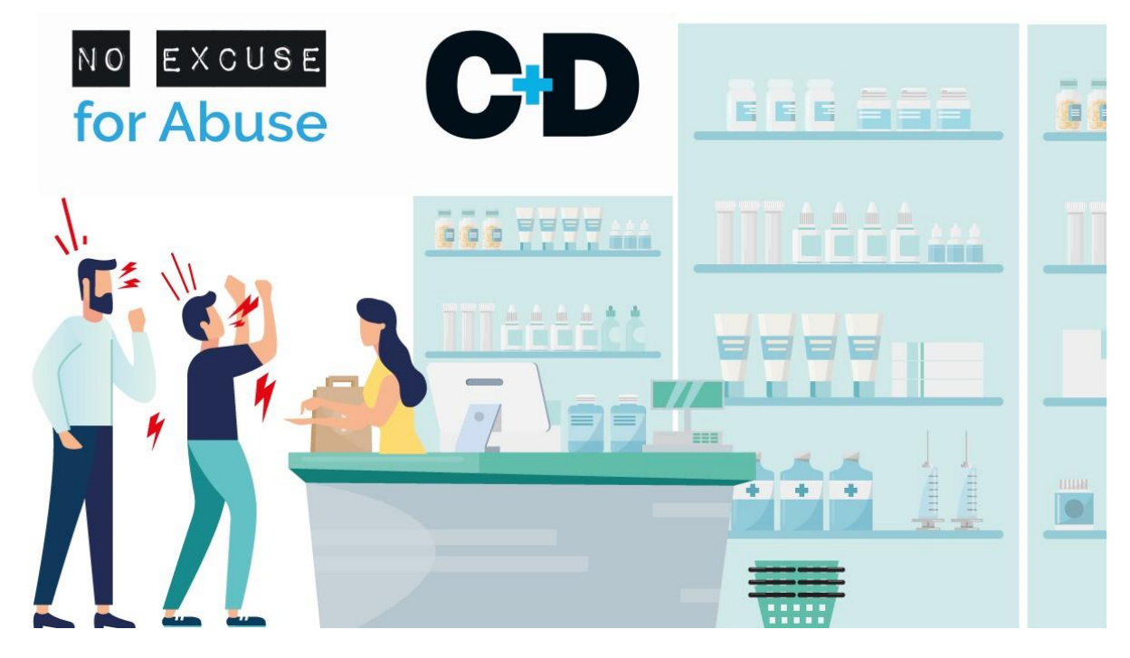
Crimes in pharmacies: The extent and severity of crimes – including violence – pharmacy teams faced over 2019-21